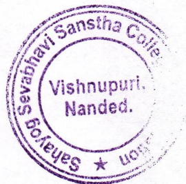
Principal Sahayog Sevabhavi Sanstha College of Education Vishnupuri, Nanded.

Action Research Projects : We encourage students to engage in action research projects, addressing real-world educational challenges. Teachers guide them through research, fostering critical thinking, problem-solving skills, and data analysis techniques.