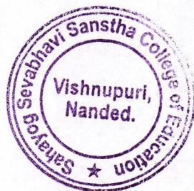
Principal Sahayog Sevabhavi Sanstha College of Education Vishnupuri, Nanded.

Conclusion : SSSCOE linkages with schools and other educational agencies have laid the foundation for meaningful academic and outreach activities. These collaborations have enriched educational practices and fostered a sense of unity within the education ecosystem. SSSCOE remains committed to building upon these partnerships and advancing local, regional, and national education.